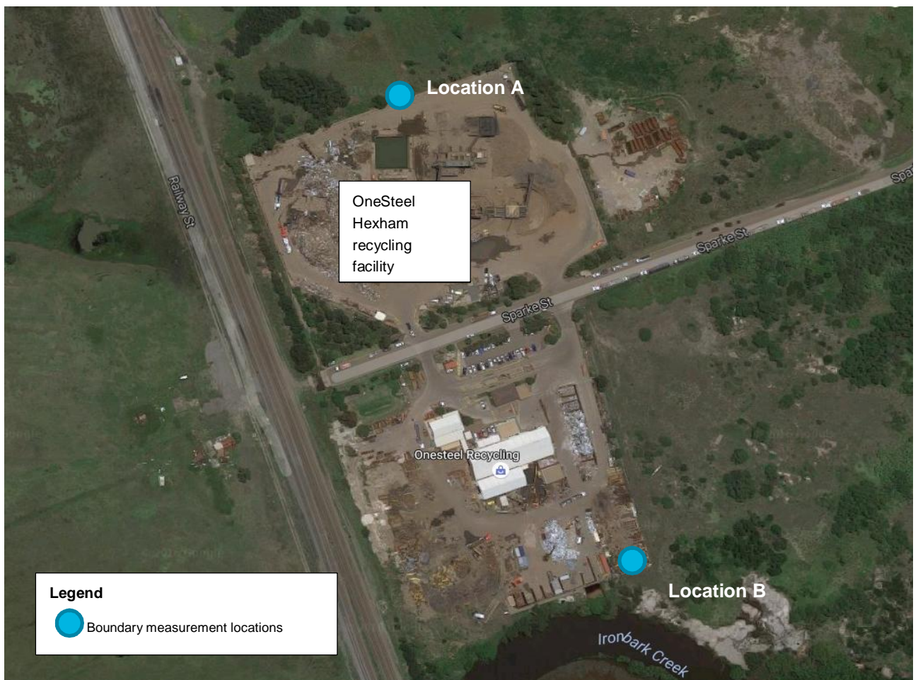
Figure 2 On-Site Measurement Locations