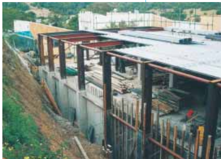
The steel frame serves as retaining wall on the deeply excavated site.

Galvanised steel angles (150 x 90 x 10) were bolted to the edge beams to provide support for the brick facade, chosen to match the University's existing buildings. The internal