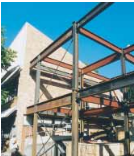
The fully braced steel frame, nearing completion.