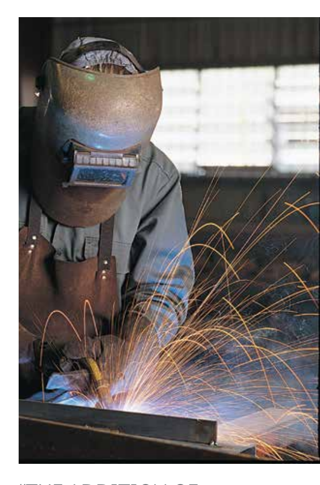
"THE ADDITION OF BORON TO STEELS IS KNOWN TO HAVE A NEGATIVE IMPACT ON WELDABILITY."

A test certificate that complies with these Australian Structural Steel Standards must contain all the items on the check list in English alphanumeric characters: